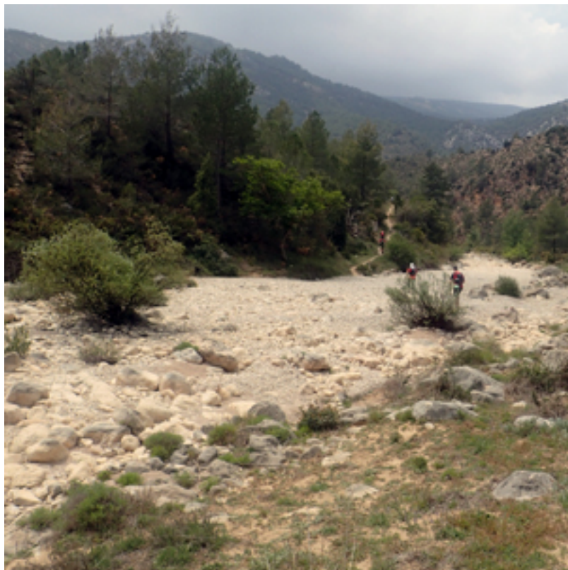
Running down over rock